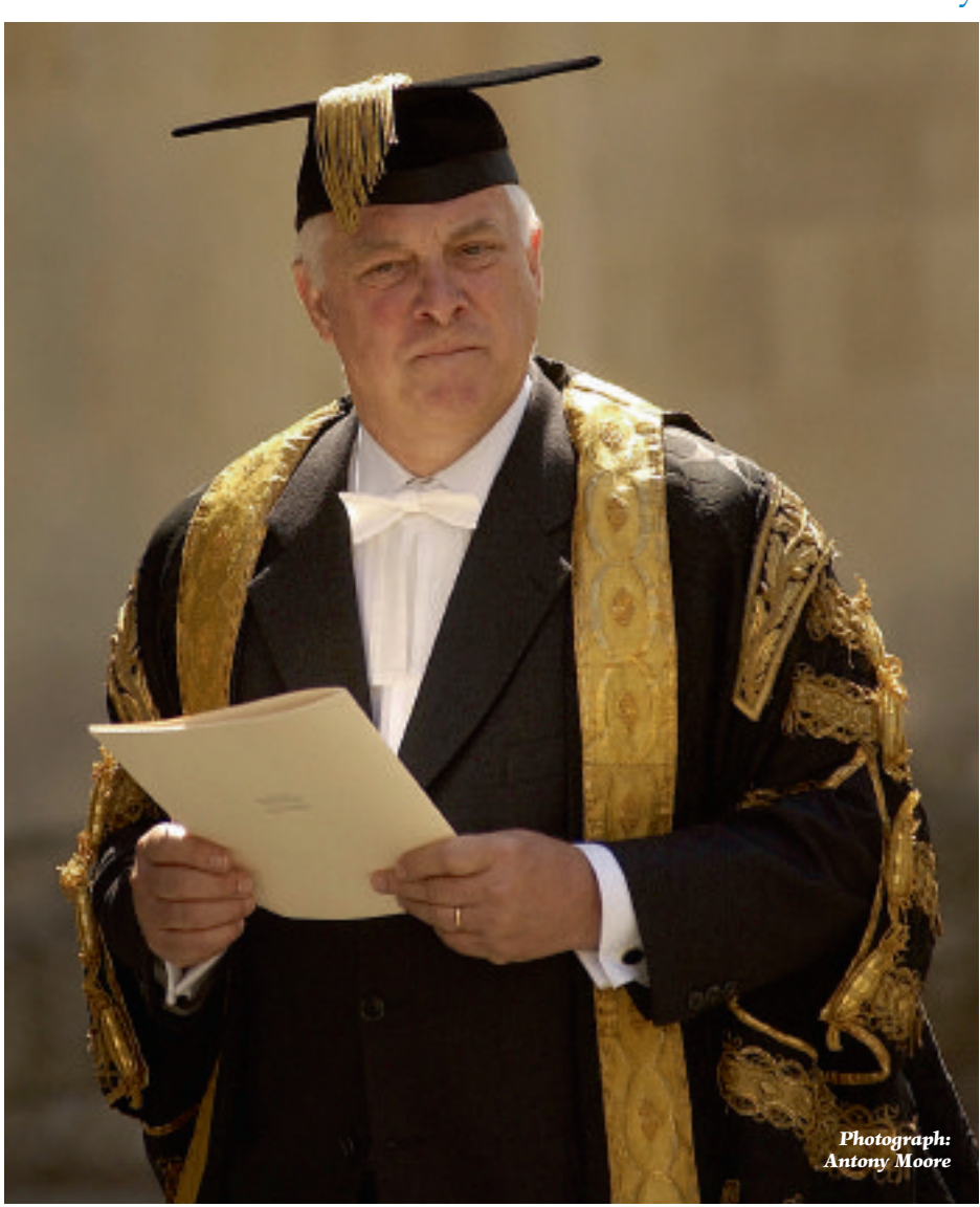
"Hong Kong has all the characteristics of a free society, except the ability to elect its own government. I would say it has reached the mid-point of my hopes and expectations. Hong Kong has a greater sense of citizenship than anywhere else in Asia."

"It is thanks to my history master at St